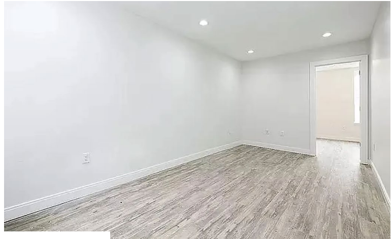
Photos of Free Market Unit